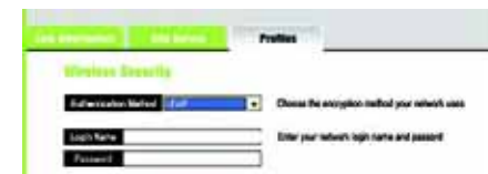
Figure 6-23: EAP-LEAP Authentication